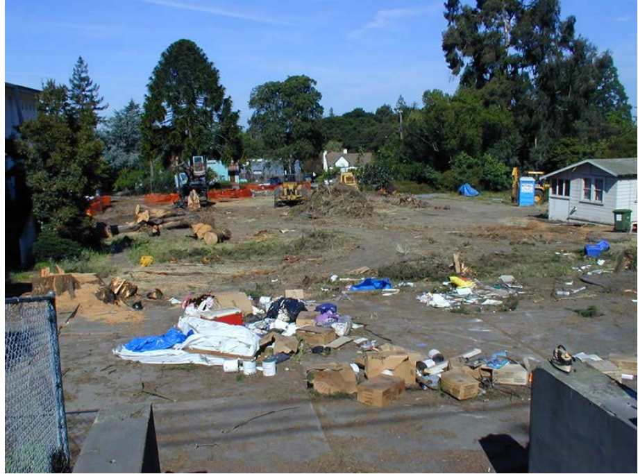
Site of new Beth El synagogue, with trees already removed.

Isengard). When reading Lord of the Rings back in the 60's, part of the appeal of the book to college students may have been parallels to environmental issues and war. In fairness, we have to say that they have done a tolerable job so far in rehabilitating the portion of Codornices Creek that flows above ground on their property. Also the remaining trees on the property are in the Codornices Creek corridor-habitat zone, which has been mostly preserved as a positive outcome of the bitter struggle that we had with the synagogue from