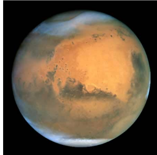
Mars image (HST)