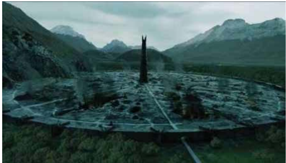
Isengard illustration from http://www.thezreview.co.uk/images/ttnp2.jpg http://www.thezreview.co.uk/news/news116.shtm